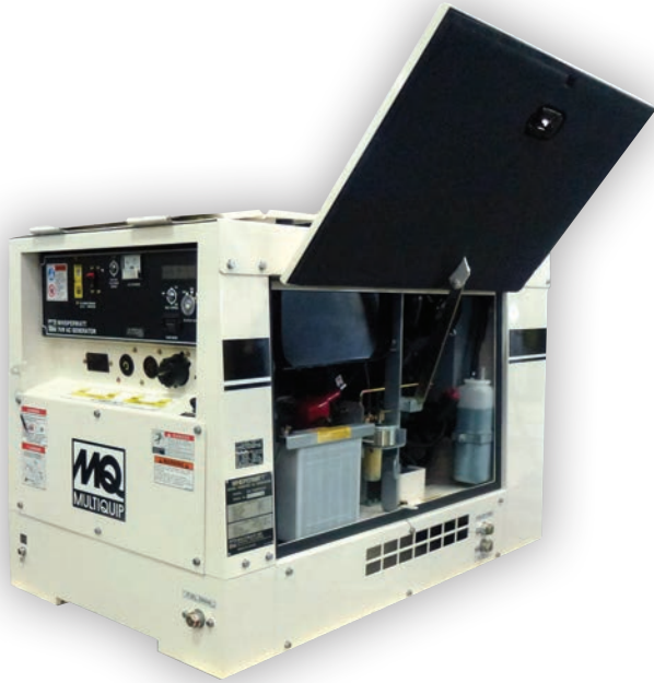
Model: DA7000SSA3 Equipped for single side maintenance

Single side service access is standard with the DA7000SSA3. Maintenance is simplified to enable all service points (fuel filter, oil filter, battery, coolant, air filter and drains) to be accessed from the same side of the generator. It is recommended for applications where the generator will be permanently mounted on equipment or installed in an area with obstructed access to the cabinet.