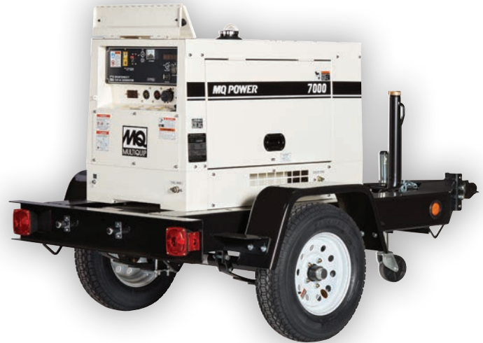
Model: DA7000SSA3 shown with optional trailer mount